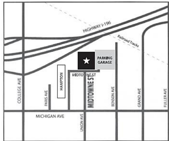
★ MidTowne Medical Center/OAM Surgery Center at MidTowne

You may park in the ramp on the East side of the Surgery Center building. Drive down one level to park in the covered parking area on Level B, where you will be discharged. Bring your parking ticket in with you to the Surgery Center as it will be validated for you for free parking.